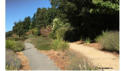
Pathways & Planting at Atherton Ave.