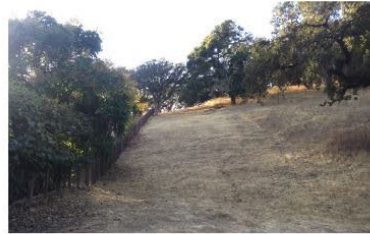
Fire Fuel Reduction