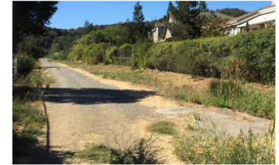
Trail & Drainage