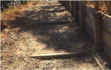
Pedestrian Paths, Stairs, & Retaining Wall