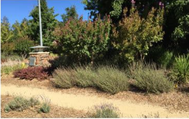
Planting at Front Entry