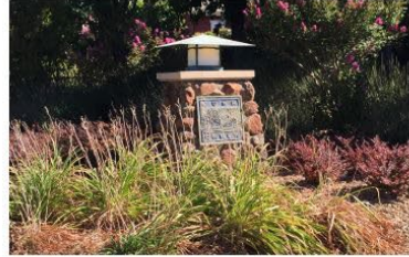
Lighting at Front Entry & Cul de sac