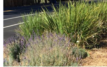
Planting at Atherton Ave.